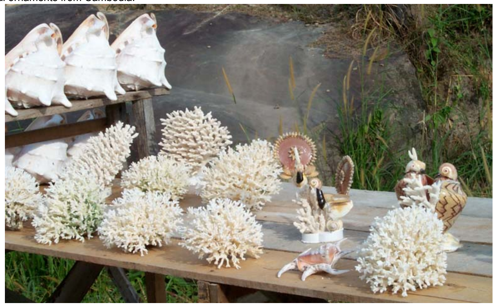
Figure 1. Coral ornaments from Cambodia.

Royal Decree (Effective Date: November 01, 1993)